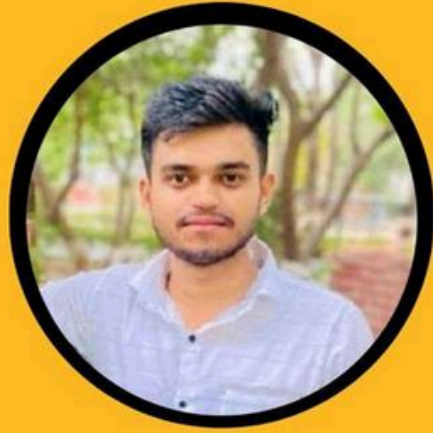
YASH DHAMAK VOIS 5 LPA